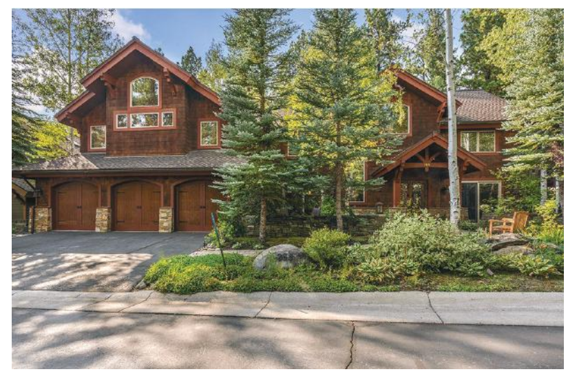
$4,400,000 265 Glen Way #4, Central South