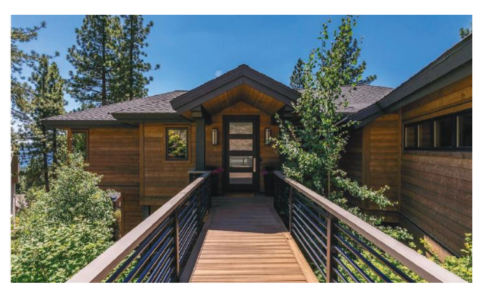
$9,175,000 551 Alpine View Dr., Eastern Slope