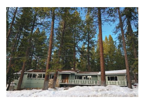
$2,675,000 650 Martis Peak, Lakeview Subdivision