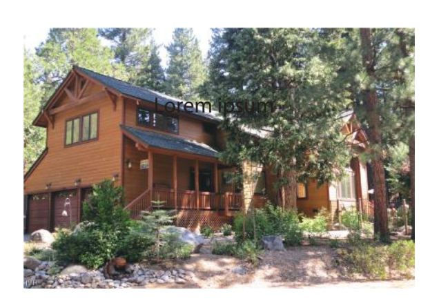
$3,350,000 300 Second Creek Dr, Ponderosa