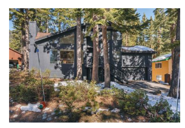
$1,535,000 562 Chiquita Court, Lower Tyner